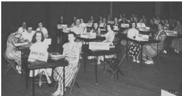
HALF OF THE DELEGATION AT THE BUSINESS MEETING