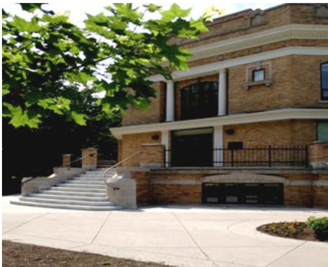
WILLIAMS HALL.