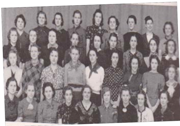
ALPHA GAMMA CHAPTER